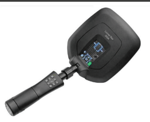
NLJD-Dual Frequency Sensor)