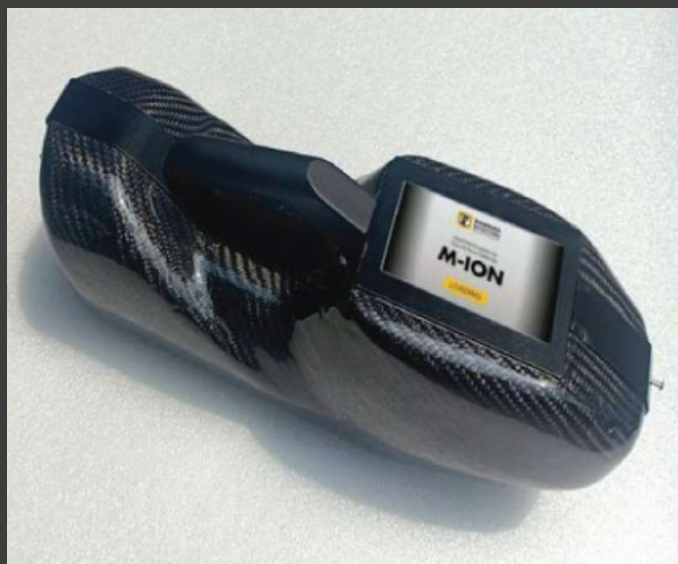
EVD (Vapour and Trace)