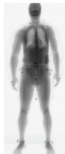
B/w X-ray image Persona scan)