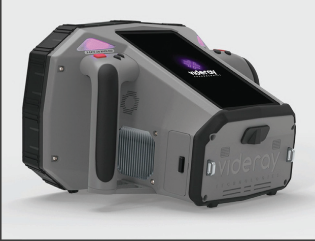
Back Scatter X-Ray Screening Device